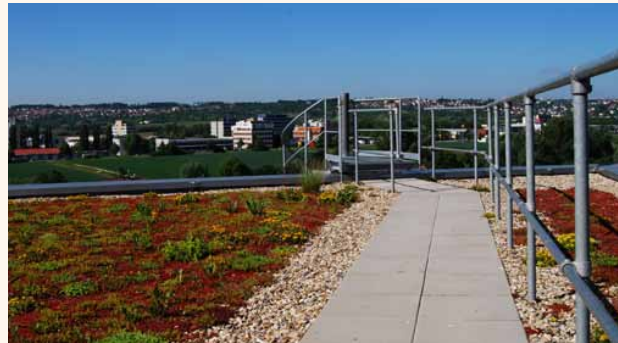
Maintenance and care access points with extensive Green Roofs