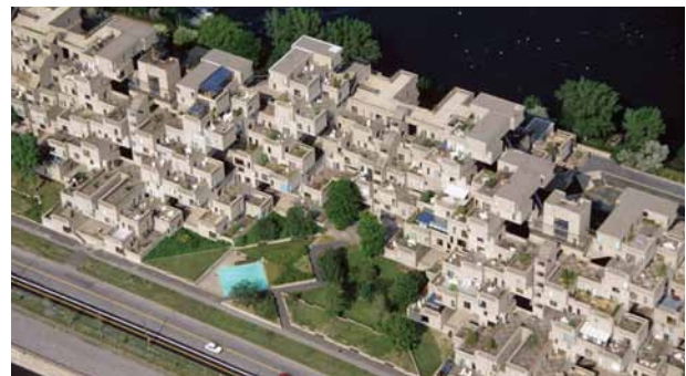
Habitat Montreal 1967. Copyright: Safdie Architects

Sky Habitat Singapore 2011 – The challenge of high plot ratio was solved in this condominium design by positioning one-third of the units with an individual garden terrace, and multiplying the ground plane with three commonly accessible garden bridges. Copyright: Safdie Architects