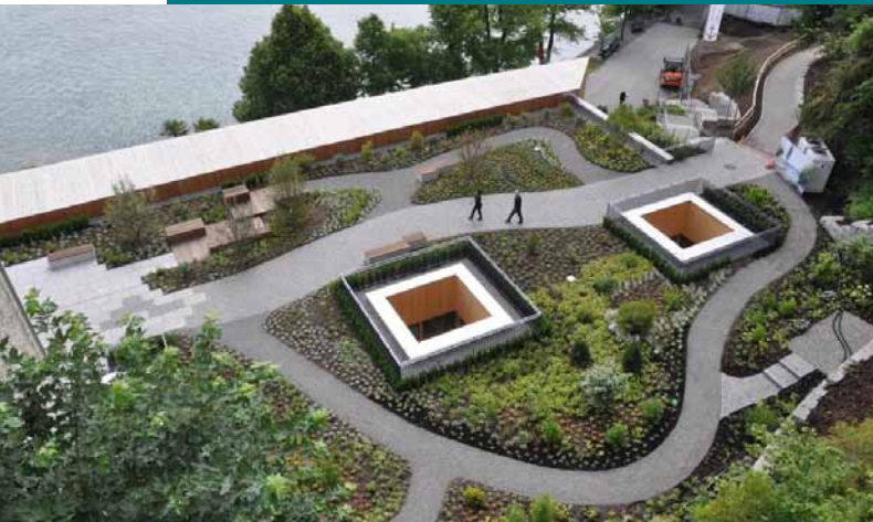
The Green Roof approximately doubles the usable space of the building.

In 2011, the managing committee of the Isle of Mainau on the European Lake of Constance opened a design competition for the construction of their new restaurant. The result was a concept for a sleeker, smoother, more modern and more environmentally integrated design. Increased seating, full uninterrupted glass façade and terrace area with a view over the water, but most importantly, the new design would host a fully developed roof garden overhead. As of 2014, the Mainau Green Roof has opened to the public to great acclaim.