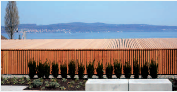
The Green Roof offers a perfect panorama over the Lake of Constance.