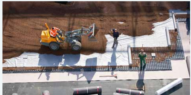
The installation of the Green Roof on the island was a logistical challenge.