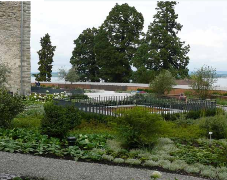
The diverse garden arrangements lies in the hands of the park management.

The Island is already studded with attractions, including greenhouses full of exotic plant species, traditional tulip and rose gardens, a large arched glass conservatorium containing the largest butterfly house in Germany, an adventure ropes course and naturally, the medieval Comturey Tower, a stone structure built on the island shortly after the turn of the 13th century. As a matter of fact, with a project budget of 7 million Euros, the new restaurant together with the Green Roof is the greatest monetary investment to the Island of Mainau. But with that investment comes a new image, and this one is even greener.