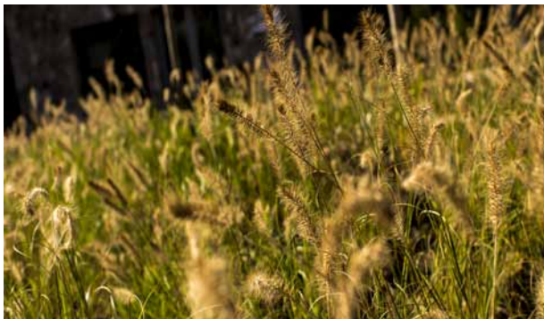
Native grasses of Armenia.