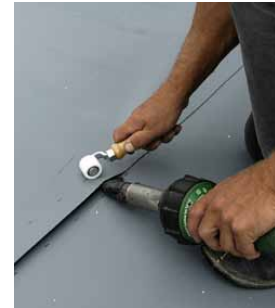
Welded seams on bitumen sheets/welding plastic sheeting