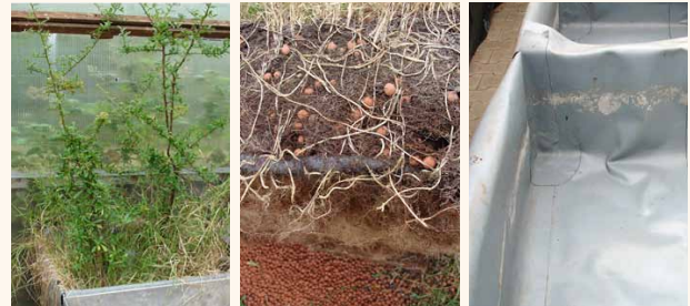
Test plants: Fire Thorn and Couch Grass

As an alternative for the so-called FLL test pursuant to the rules of the FLL there is testing according to European DIN standard DIN EN 13948 "Flexible sheets for waterproofing – Bitumen, plastic and rubber sheets for roof waterproofing – Determination of resistance to root penetration". This method deviates considerably from the FLL test. The most serious difference lies in the simplified testing without stress on the test sample by the particularly root-aggressive rhizome-forming quack grass.