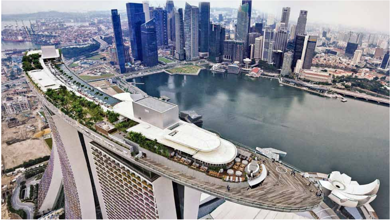
Marina Bay Sands Singapore 2010.

the impact to bridge and network tall, mixed-use buildings, while a subsequent research topic aimed to revisit and rearticulate the objectives of the original Habitat project, once again "for everyone a garden." The practice-oriented research continues to inform current building projects globally from New York City to Singapore.