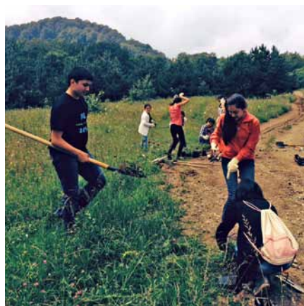
Local volunteers collect grasses and flowers from the mountains. Copyright: Tim Flynn Architects

manufactured a blend of Dilijan soil which provides the basis for the roof and green wall substrate. There is a huge mining area for obsidian and ceolithe close to neighbouring Lake Sevan, so the mineral rich soil was mixed with local peat and lava – creating a unique and fertile soil blend for the walls and roof.