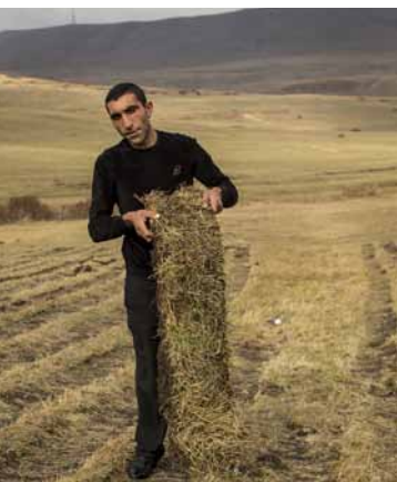
Hand cut grass sods will line the roof borders. Copyright: Tim Flynn Architects

The ethos of “putting back” has been at the heart of the design with an important concept for the school focused on restoring the natural vegetation which was disturbed during the construction phase. Therefore the former green orchard in the valley has been replaced by “putting back” the meadow on the roof and covering the vertical walls in plant modules. Volunteers and local workers helped collect native flora and fauna from neighbouring mountain meadows and along with hand cut grass sods, these have been used to frame the Green Roofs, providing the starting point for grass, flowers and herbs to flourish. Local workers