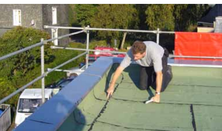
Roof edge bitumen waterproofing

Inspection of the waterproofing is to be carried out very carefully and can be done on a dual tier basis. A visual inspection is obligatory as a first step. If there are external contractors working on the roof during the transition period between waterproofing approval and the Green Roof pre-installation inspection, or if there are other reasons for an increased danger potential, extra caution is needed. In the case of obvious bad workmanship, or if a technical norm requires a more thorough examination, the visual examination is insufficient. It might be necessary to bring in experts. Furthermore, there are various testing procedures for finding leakages and damaged roof sheeting. The following aspects need special consideration: