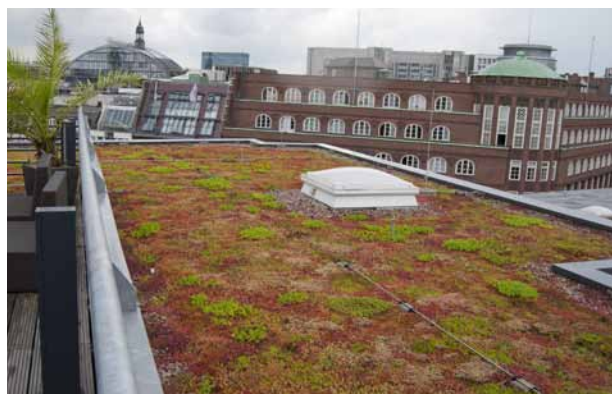
Green Roofs – A strategy for climate change adaption in the city centre

The Green Roof strategy should connect the urban development policy goal of growing a compact city with a climate-friendly construction and the political objectives of adaptation to climate change and climate protection in new and innovative ways. With the increasing number of Green Roofs, temporary water retention should be improved even during strong rain events, biotope and species diversity should be increased, and the green volume in structurally dense neighborhoods should be improved. Roof surfaces made available in the concentrated city will also offer new visiting and recreational areas for citizens of the 1.8 million metropolis in the North of Germany.