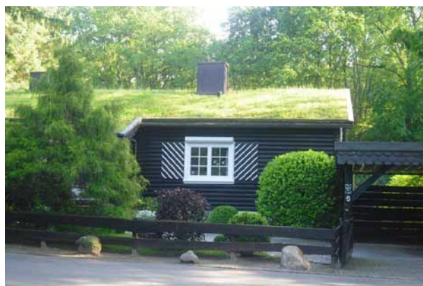
Some of Hamburg's Green Roofs date back for more than 60 years.

Financial Incentives and Building Codes: In order to create more Green Roofs, Hamburg will begin a support program for Green Roofs in the amount of 3 million Euros in 2015, lasting for 5 years. Also, a split wastewater fee was introduced; if they have a Green Roof, owners pay only 50 % of the stormwater charge. In addition to this funding incentives for voluntary measures a binding regulatory framework will be developed in the Hanseatic city and the available legal instruments such as the Building Code, Zoning and the Nature Conservation law will be used more to create Green Roofs.