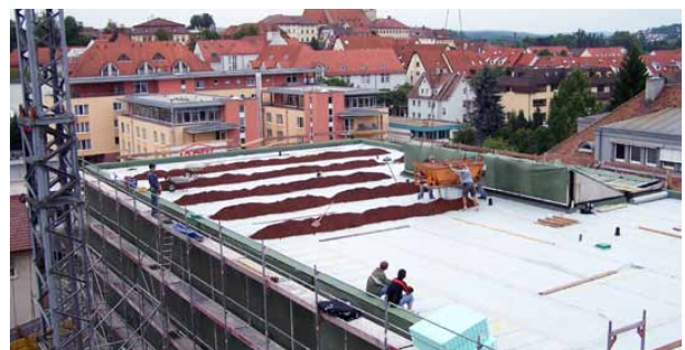
... and Green Roof installation.