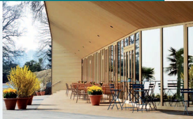
In the bottom floor is the new Comturey-Restaurant.

Also known as the Bodensee in German, the Lake of Constance is located at the geographical intersection of Germany, Austria and Switzerland. It is located less than two hours' drive from major cities such as Strassbourg, Stuttgart and Zurich. Home to a baroque castle, rose gardens and green houses, the site has an established history of visitation and tourism, with the impressive Swiss Alps visible on the horizon across the water. Now, those views can also be enjoyed from a pristine, colorful and diversely landscaped Green Roof.