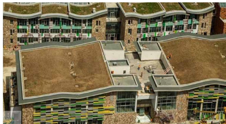
UWC Dilijan preparing the roof. Copyright: Tim Flynn Architects

Playing fields, tennis courts and soft landscaping throughout invigorate the area. Completion of the whole campus is anticipated by 2020 and at full capacity this co-education secondary school will house 650 students and staff.