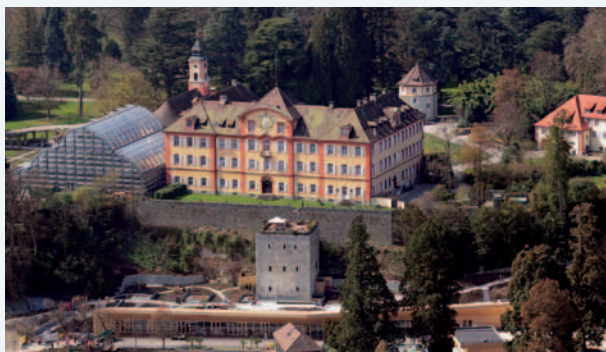
The harbor area of the Island of Mainau – In the foreground is the Comturey construction site.

In 2011, the managing committee of the Isle of Mainau on the European Lake of Constance opened a design competition for the construction of their new restaurant. The result was a concept for a sleeker, smoother, more modern and more environmentally integrated design. Increased seating, full uninterrupted glass façade and terrace area with a view over the water, but most importantly, the new design would host a fully developed roof garden overhead. As of 2014, the Mainau Green Roof has opened to the public to great acclaim.