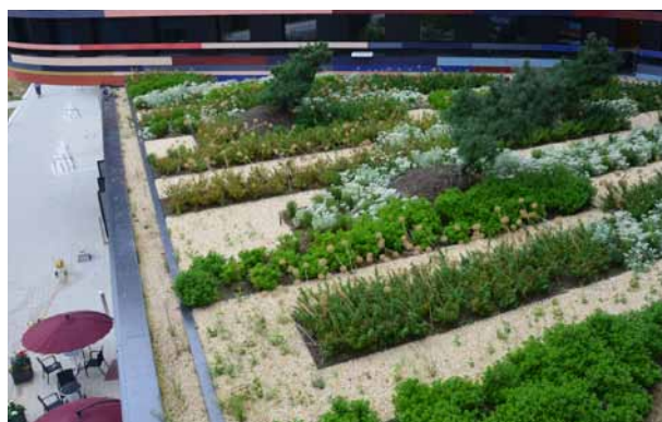
The new headquarter of the Authority for Urban Development and Environment Hamburg is leading by example.

Financial Incentives and Building Codes: In order to create more Green Roofs, Hamburg will begin a support program for Green Roofs in the amount of 3 million Euros in 2015, lasting for 5 years. Also, a split wastewater fee was introduced; if they have a Green Roof, owners pay only 50 % of the stormwater charge. In addition to this funding incentives for voluntary measures a binding regulatory framework will be developed in the Hanseatic city and the available legal instruments such as the Building Code, Zoning and the Nature Conservation law will be used more to create Green Roofs.