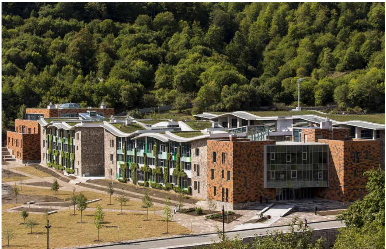
UWC Dilijan in context.