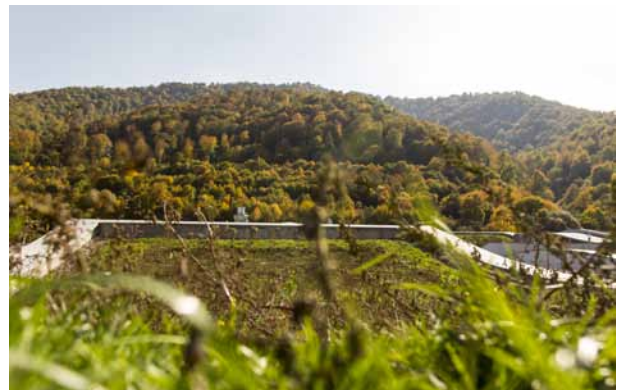
UWC Dilijan Green Roof.

http://www.glada-berlin.de/framesetE.html