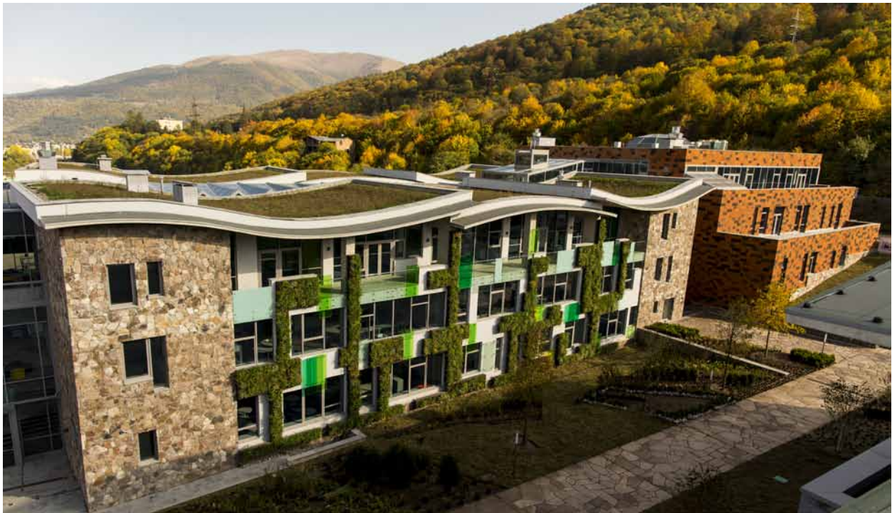
UWC Dilijan in autumn.

Tim Flynn Architects (TFA) is an international team of architects and designers with offices in London, Yerevan and Moscow. In 2007, TFA was commissioned to deliver the architectural design, interior design, fit-out and landscape design elements for UWC Dilijan College in Armenia. Project managing and carrying out work from the TFA London and Yerevan offices, and in collaboration with a large number of experts, engineers, suppliers and designers from Armenia and around the world, the aim was to design an inspiring educational facility built with state-of-the-art environmental principals that would be the first of its kind in Armenia.