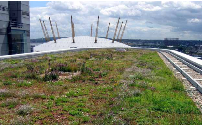
Extensive roof greening: attractive ecological protective cover

From the design engineer's perspective, a roof is only the uppermost exterior component of a building. It is an integral part of the external shell, satisfying human protection requirements – protection from climatic influences, rain, wind, and sun as well as protecting people and property inside the building. Thanks to its characteristics of providing space (as a result of its gradient), the flat roof or low-slope roof – as special type of roof – demands being designed and used as an additional space. Green Roofs and roof gardens serve this task well.