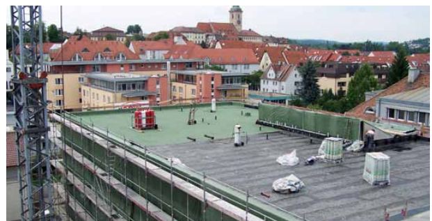
... for roof waterproofing ...