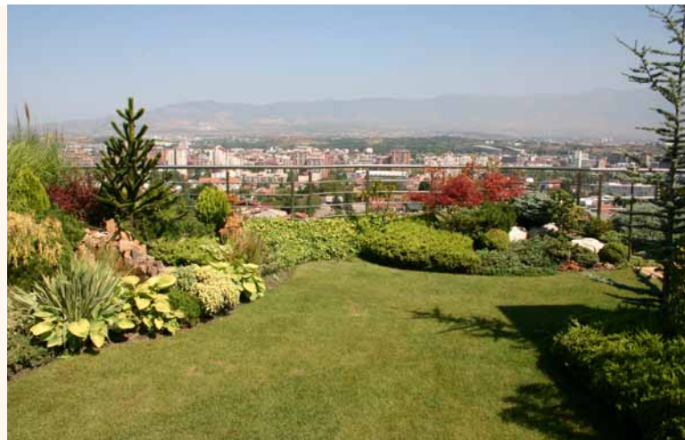
Intensive roof greening: utilized roof areas need higher load reserves

Landscapes emerge on the roof with various surfaces, gardens and walkways, different kinds of plants. From this perspective, the question for the technically knowledgeable person is how to design the roof construction over the roof's basic function of weatherproofing – and how to eliminate any additional risks accruing from this. The effects of a Green Roof designed in a visually appealing fashion are quickly overshadowed if, for example, the sealing fails and the roof leaks. Technical regulations are available which can be used as an aid in producing functioning, thermally-insulated and sealed roofs that can be greened.