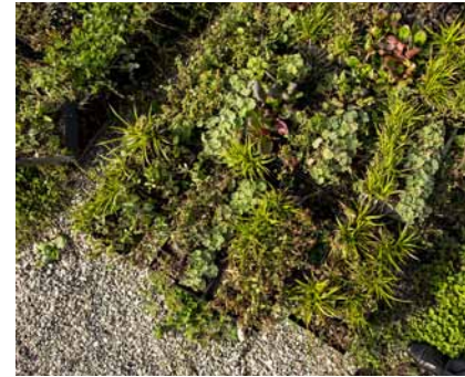
A system of plant varieties for different areas. Copyright: Tim Flynn Architects

A complex system of planting schemes was created to ensure the right plant varieties for specific positions around the buildings with over 40 different species selected. A nursery of 4,000 m 2 has been set up within the school’s ground to mix soil and prepare the plant modules for the living walls –with the modules watered, fertilized and maintained on the ground for 6–8 months prior to installation. A key belief informing the landscape design has been that nature is indeed cyclical. Instead of engineering or forcing the maintenance of the grasses on the roof – there has been a focus to remain in-synch with the seasons of Dilijan. Due to the local conditions, 1,100 m above sea level and with 700 mm rain per year, no irrigation system was installed on the roof. As the air is often humid in the evenings, this provides ideal conditions for plants to work together with the seasonal elements of Dilijan. The roof thrives and grows along with the hot and cold seasons of Armenia.